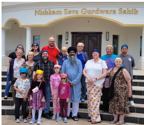
Neighboring Faith Family Field Trip to a Sikh temple