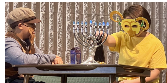
"Hershel and the Hanukkah Goblins", a production from the 2023 holiday season

"What if talking about racism was as easy as baking a cake, frying plantains or cooking