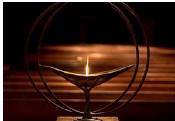
Our chalice, which we light for peace, love, hope and unity

This 12-session curriculum is based on J.L. Shattuck's Ellery Churchmouse video series and introduces children to spiritual vocabulary in a fun and engaging way. The elementary curriculum contains discussion questions and activities designed for kids in grades pre-K through 5.