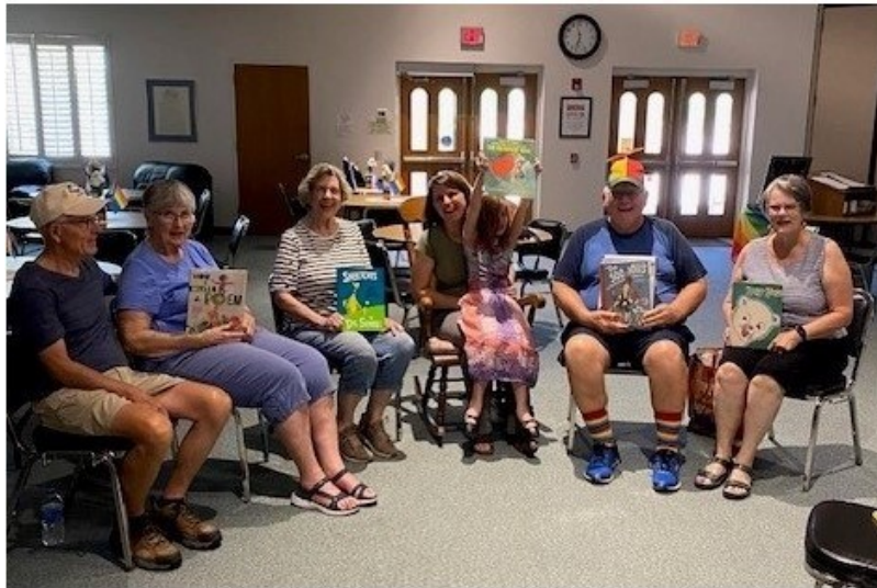
Questers – "Read Me a Story"